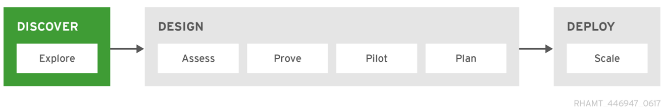
Figure 6.2. Red Hat migration methodology: Discover phase