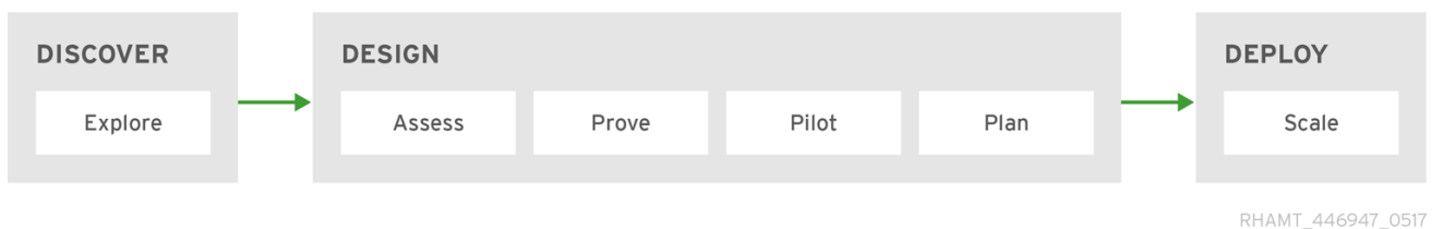
Figure 6.1. Red Hat migration methodology

The approach consists of the following phases: