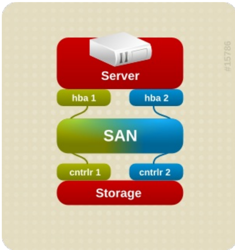
Figure 1.3. Active/Active Multipath Configuration with One RAID Device