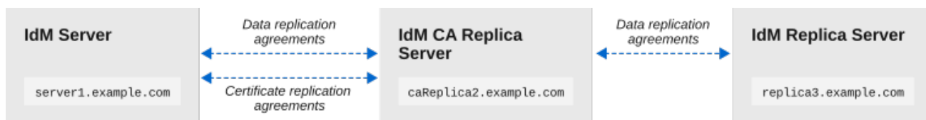
Figure 5.1. Replication topology used in this example

Restore an IdM server, or its LDAP data, from an IdM backup.